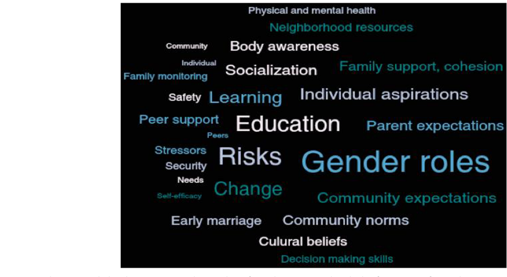
Fig. 1 FGD theme word cloud. Note: Size and centrality of words correspond with the frequency of FGD themes

When asked if boys faced similar risks when walking alone, one respondent said,